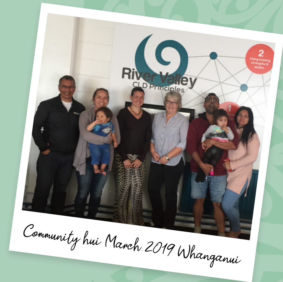
Community hui March 2019 Whanganui