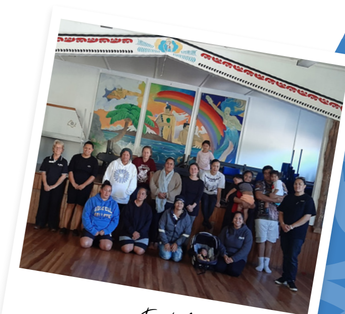
First Aid Course 2020

Tū Te Ngana Hau as a programme is becoming widely known in and around the Whanganui district including Ohakune.